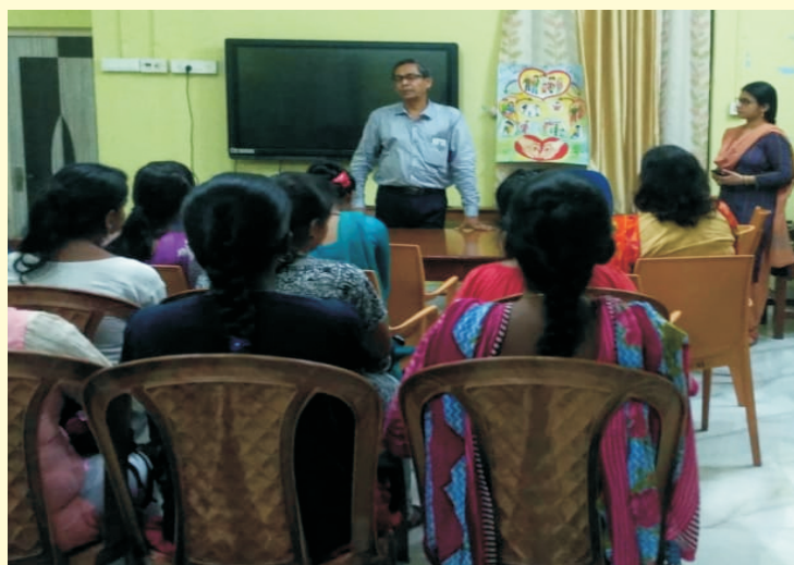
Departmental programme of Family Values

Mail id: blengshu@gmail.com Head of the Department (Contact No. 9748626650)