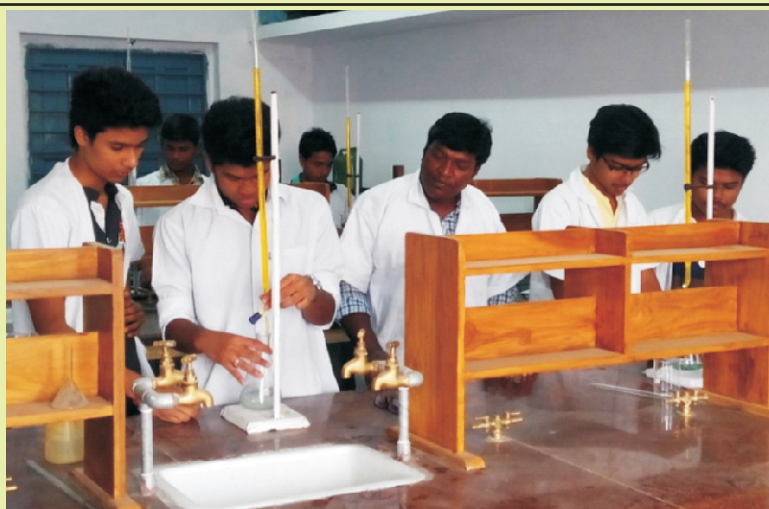
Students are doing practical in laboratory

Head of the Department (Contact No. 9874556847)