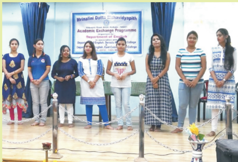
Academic exchange programme

Mail id: mdmenglish2018@gmail.com Head of the Department (Contact No.9831598089)