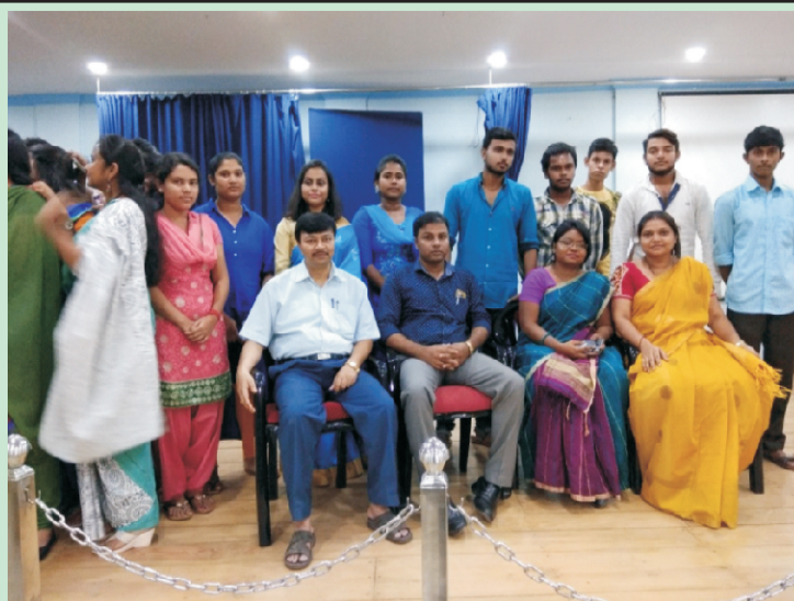
Academic Counselling Programme for 3 rd Year Students

Mail id: mdmeducation1@gmail.com Head of the Department (Contact No. 9433306060)