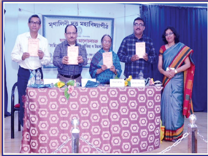
Moment of Pride : Prestigious Book Release in the IQAC collaborated International Seminar