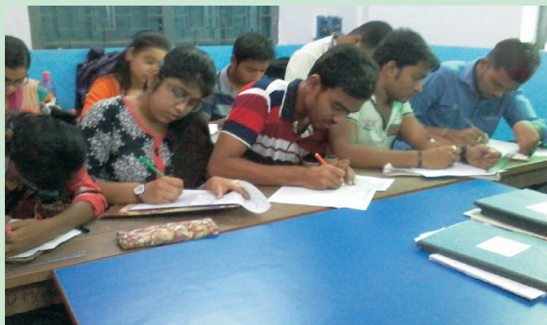
Students of the department

Mail id: economicsmdm@gmail.com Head of the Department (Contact No.9830775198)