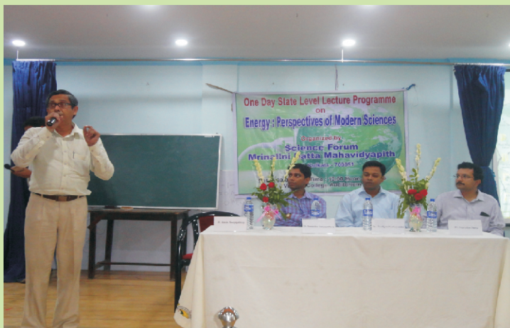
Participation of the department in science forum programme

Mail Id: physics.mdm@gmail.com Head of the Department (Contact No.8910539134)