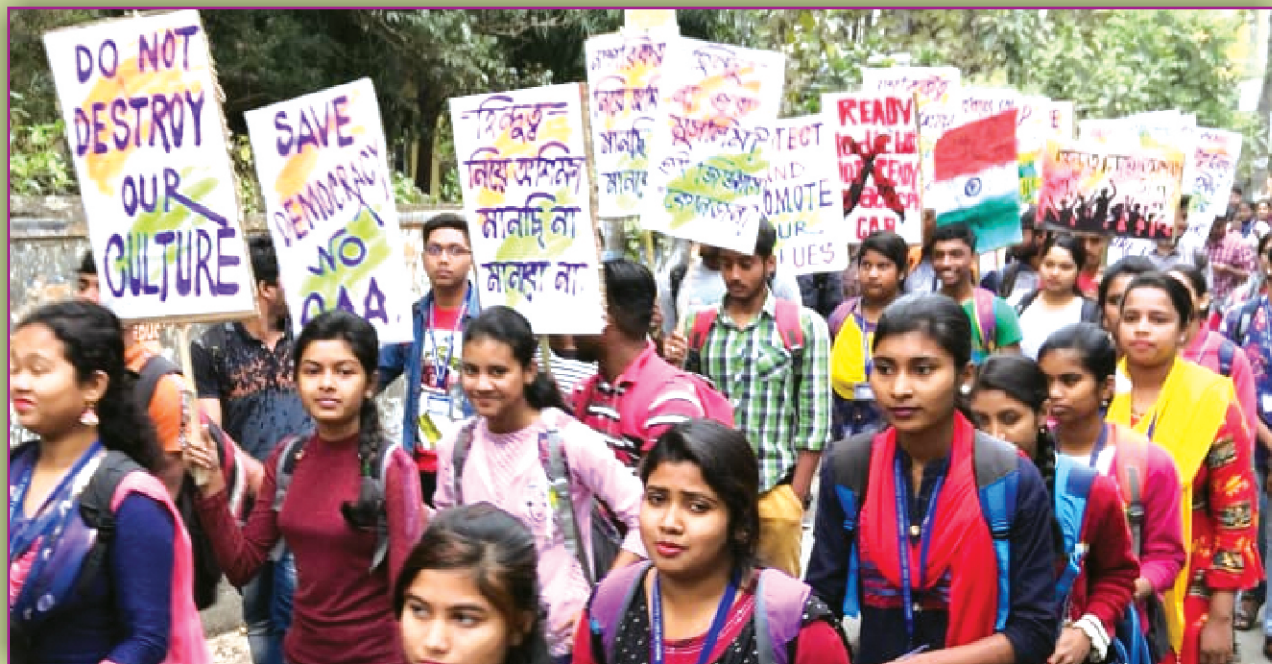
A Silent Rally on National Integration, Constitutional Equality, and Social Justice by Students, Teachers & Non-teaching staff of MDM.