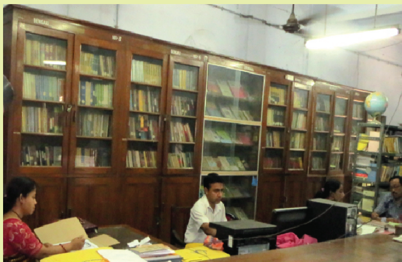
Library Staff Members