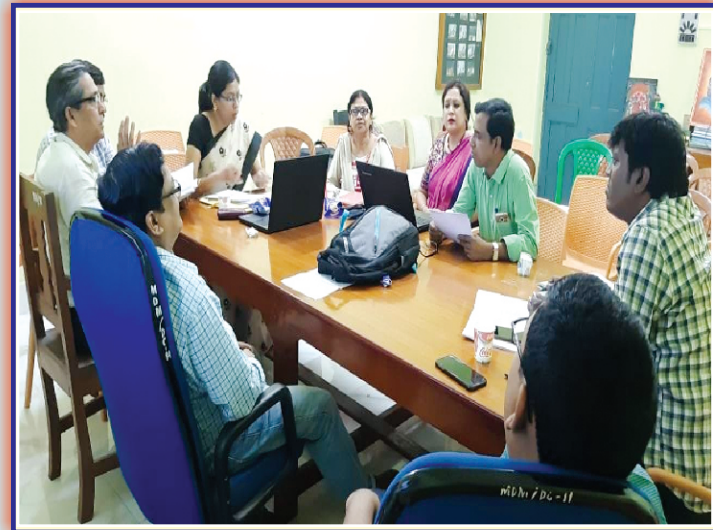
IQAC Members conducting meeting