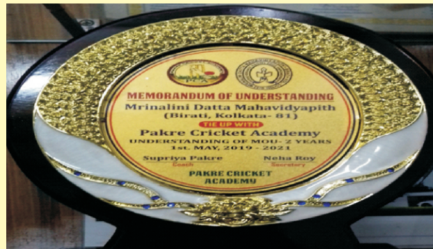
Memorandum of Understanding of MDMCA

Mrinalini Datta Mahavidyapith has entered into a partnership with Pakre Cricket Academy(59 th Ananth Nath Deb Lane; Belgachia, Kolkata- 700037) to form Mrinalini Datta Mahavidyapith Cricket Academy (MDMCA). The Training Partner will remain responsible in imparting Cricket Training Course to the students enrolled with Mrinalini Datta Mahavidyapith Cricket Academy and in issuing Certificates to them jointly by the college and the Training Partner on successful completion of the course. The training will be imparted from the session, 2019-2020. The Training Partner will impart training to the enrolled students within the college playground. The Cricket Training Course for the prospective college students will be provided by the Training Partner free of cost.