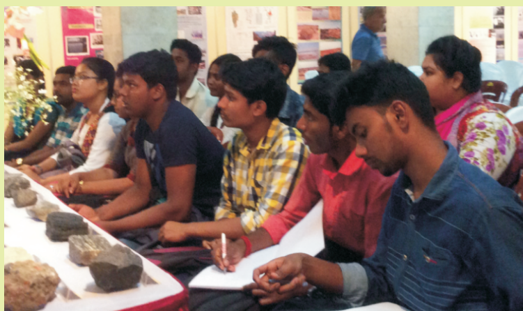
Students undergoing Hands-on Training Course on Rocks and Minerals identification at GSI

Mail id: mdm.geography@gmail.com Head of the Department (Contact No.9830118983)