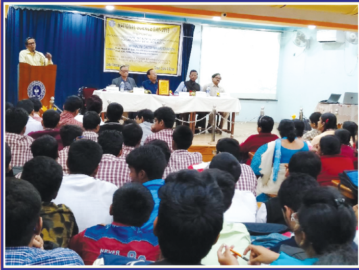
Celebration of National Science Day in our college