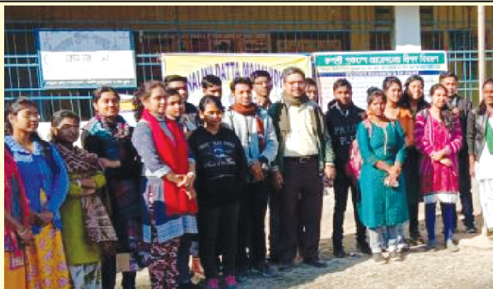
Field visit and awareness camp at Andu Bana Basty, Alipurduar District.

Mail id: mdmanth@gmail.com Head of the Department (Contact No. 9830126687)