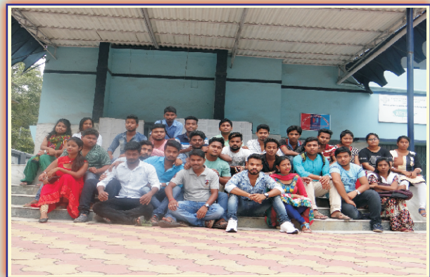
Mukta Mancha of our College