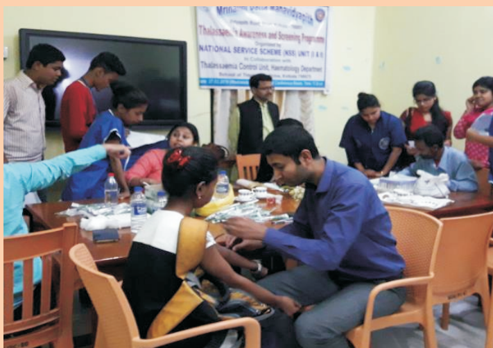
Thalassemia awareness programme

Contact us (Mob. 9874556847 / 9836624446) for enrolment and training programme.