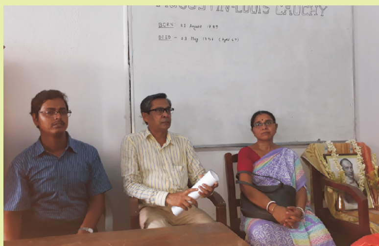
Birthday Celebration of Augustin-Louis Cauchy

Mail id: mathematicsmdm@gmail.com Head of the Department (Contact No.9243269721)