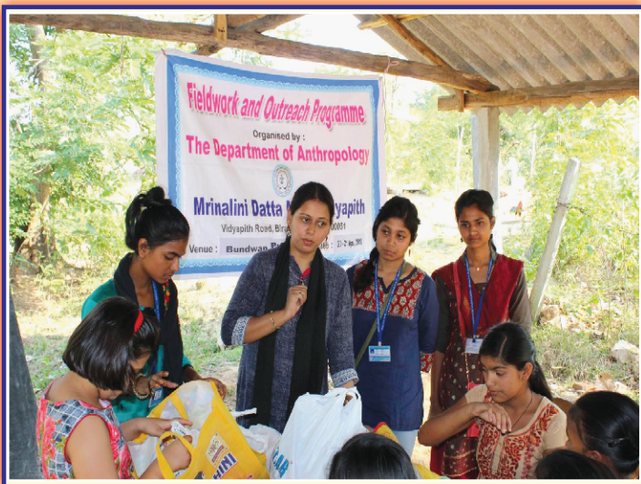
Programme conducted by the Extension and Outreach Sub- ommittee of the College