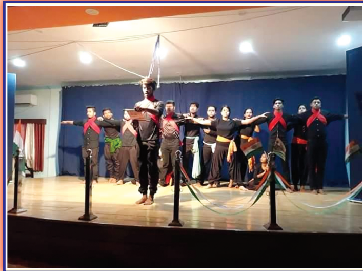
TROUPE members winning hearts