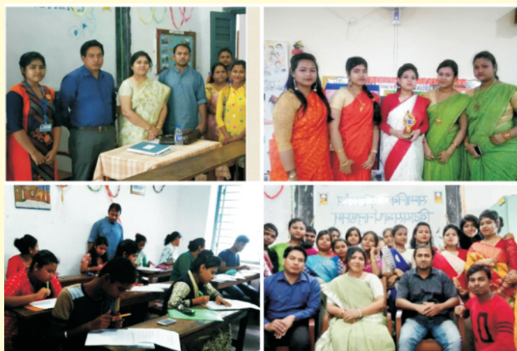
Departmental Programme and Examination

Mail id: sanskritmdm@gmail.com Head of the Department (Contact No. 9433425476)