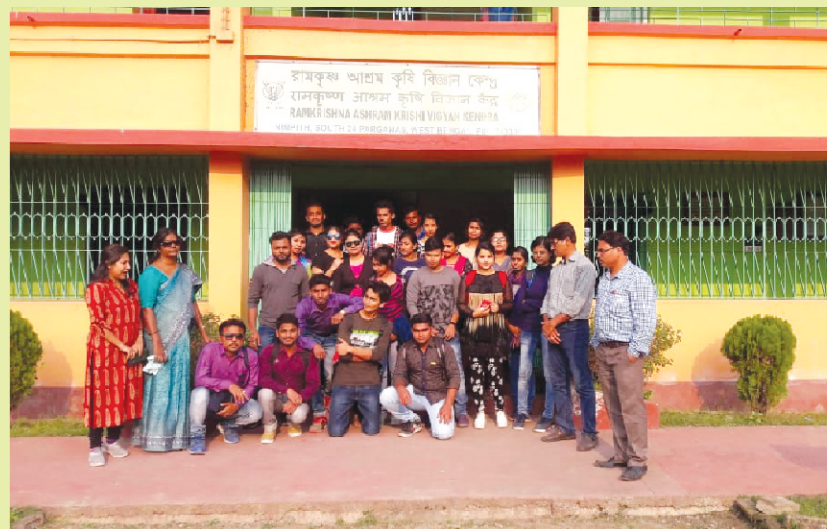
Local excursion in Sri Ramakrishna Ashram Krishi Vigyan Kendra, Nimpith, 24Pgs(S).

Head of the Department (Contact No. 9674556114)