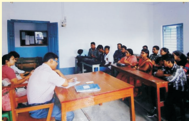
Parents-Teachers Meeting of the Department

Head of the Department (Contact No.9432219400)