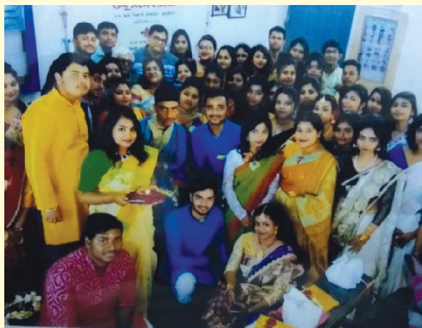
Basanto Utsav at the department

Mail id: mdmbengali@gmail.com Head of the Department UG (Contact No.9831875442) PG (Contact No.9433566368)