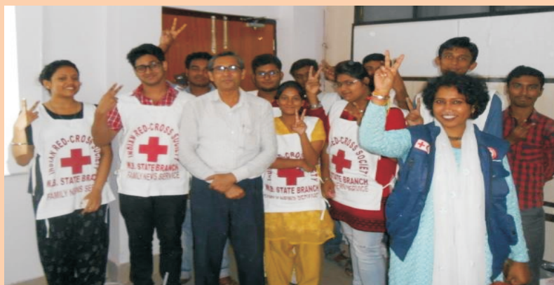
Workshop of YABC (Youth as Agent of Behavioural Change)