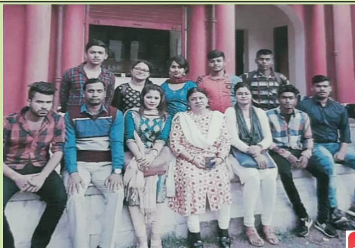
Educational Visit at Jorasanko Thakurbari (RBU), Kolkata.

Mail id: polscmdm@gmail.com Head of the Department (Contact No.9903793928)