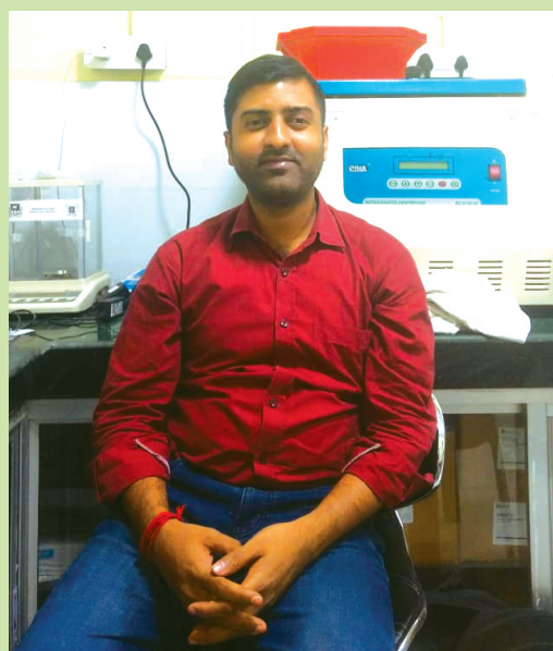
Year round activities of the department

Mail id: microbiology.mdmbarati@gmail.com Coordinator (Contact No. 9674556114)